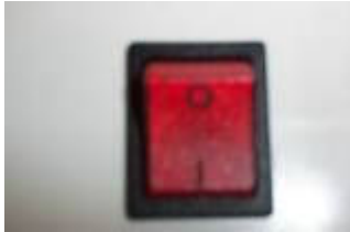
(fig. 1 – On-off Switch)

To operate your Pureheat Odyssey, proceed as follows: