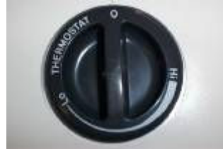
(fig. 2 – Thermostat Knob)